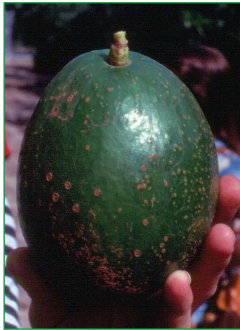
Figure 2. 'Brogdon'.

Mexican varieties grown in Texas include 'Brogdon', (Fig. 2) 'Holland', 'Wilma', and 'Winter Mexican.' 'Lula' is a popular Guatemalan x West Indian hybrid variety grown commercially in the Lower Rio Grande Valley (Fig. 3).