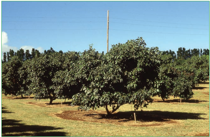
Figure 4. Avocado trees spaced 20 to 30 feet apart.

Fruit production is greatest in full sun.