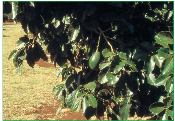
Figure 1. Avocado fruit and leaves.

Hybrids of all three species have created additional varietal types. Blooms form from January to March, with the fruit maturing in as few as 6 months for Mexican types and 18 months for Guatemalan types.