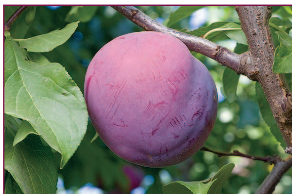
Figure 2. The dusty white coating associated with plums is known as wax bloom.