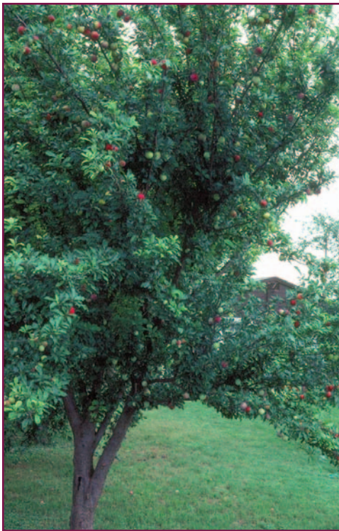
Figure 3. A 'Methley' plum tree with upright growth and a heavy fruit load in various stages of development.