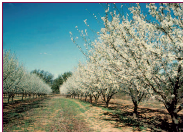
Figure 1. A plum orchard in full bloom.

The varieties adapted to Texas are usually hybrids between P. domestica and P. salicina and are known