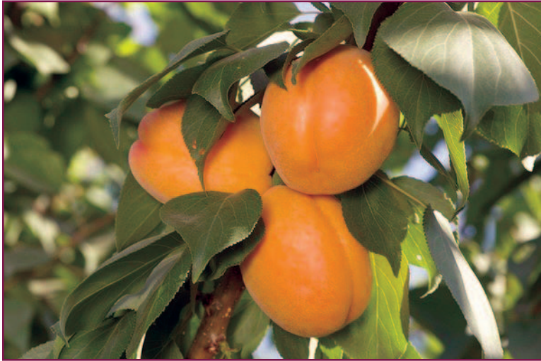
Figure 12. One of the interspecific Prunus hybrids.