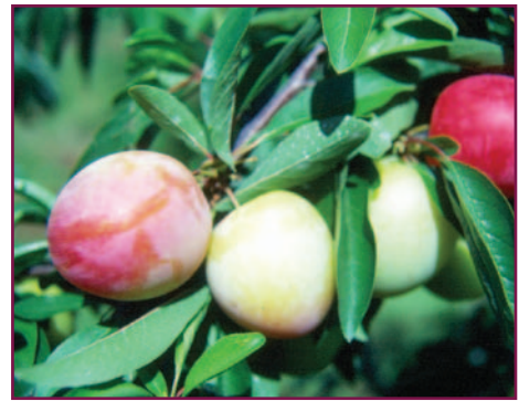
Figure 5. 'Bruce' plums.

as Japanese or Japanese hybrid varieties. Most plum varieties are not self-fruitful. You will need to plant two varieties with similar blooming periods for pollination and for fruit to set.