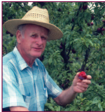
Figure 4. Eating a ripe, juicy 'Methley' plum right off the tree.