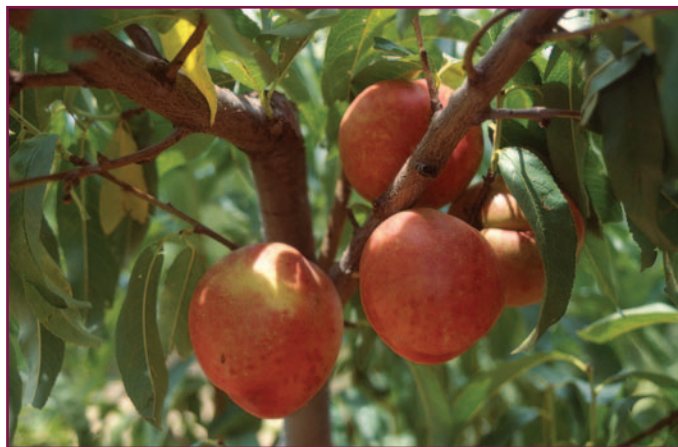
Figure 8. The nectarine is merely a peach without fuzz.

Nectarines are not particularly well adapted to Texas because their smooth skin is especially vulnerable to wind scarring and brown rot. They are also susceptible to fruit splitting and bacterial leaf spot. Nectarine culture is essentially the same as for peaches, only more intensive because of the increased disease and insect issues.