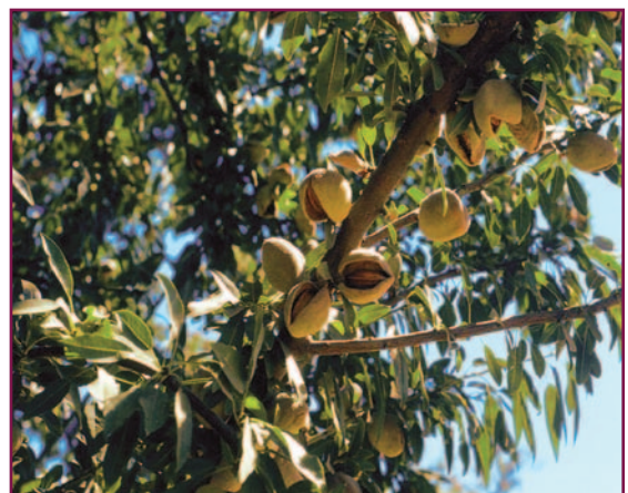
Figure 11. Mature almonds.

Almond fruit looks similar to peaches (Fig. 11). The pit is eaten as a nut. The tree looks similar also and is grown essentially the same as peaches; plant only on well drained soils, and maintain a weed free area around the tree. Almonds generally do not produce well in Texas because they bloom too early in the spring and cold weather injures the developing flowers. Most varieties are susceptible to brown rot and bacterial leaf spot. No variety is highly recommended because they generally fail to set crops. 'All-In-One' is the most common variety being tried today.