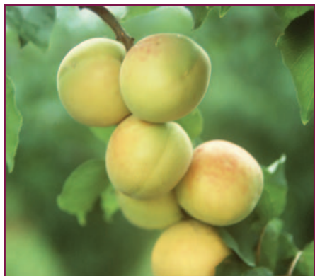
Figure 10. 'Blenheim' apricot.

Many varieties are grown across the state; some produce well 1 year, only to produce nothing for the next 5. The following varieties are adapted to Texas.