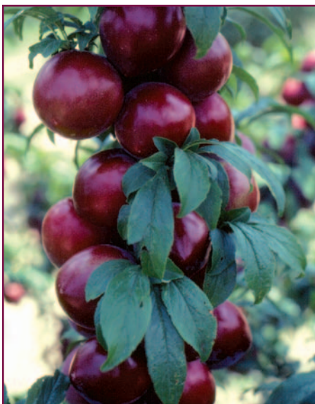
Figure 6. 'Morris' plums.